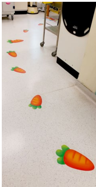
The pictures of carrots on the floor create a playful route for the ward.

The play elements were extended to outside of the ward. For example, the ceiling of the room for echocardiography became the screen for playing a "film". When the children managed to co-operate and stayed still without being sedated whilst undergoing an echocardiography, a playful ceremony was arranged for them afterwards. On the way from the ward to the treatment room, pictures of carrots had been pasted onto the floor for the children to count while going to the room. It is indeed a fun-filled route.