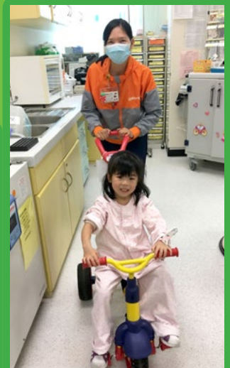
Riding a tricycle is one of the favourite activities in the ward.

The play elements were extended to outside of the ward. For example, the ceiling of the room for echocardiography became the screen for playing a "film". When the children managed to co-operate and stayed still without being sedated whilst undergoing an echocardiography, a playful ceremony was arranged for them afterwards. On the way from the ward to the treatment room, pictures of carrots had been pasted onto the floor for the children to count while going to the room. It is indeed a fun-filled route.