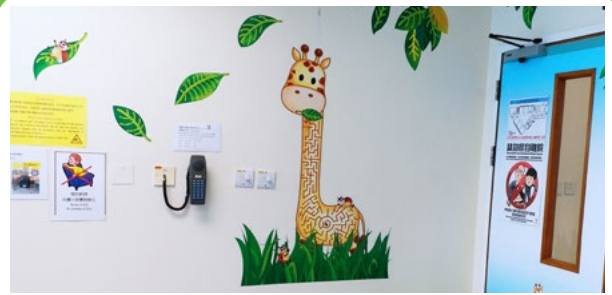
The wall of the hospital ward covered with a maze.

As a playful environment is essential in creating a playful atmosphere, it is also one of the aims of the hospital play specialists to create a delightful and safe ward that suits the medical needs. To this end, they collect children's views and favourites in designing a theme of the ward. In the case of the Tseung Kwan O Hospital, the hospital play specialists came up with a theme of "animal world" for the ward. Hence, they decorated the ward walls with pictures of animals, including a giraffe maze, colour-changing insects and colourful balloons. In a decorated ward in this way, the children can still play just by counting the number of balloons and finding insects even if they are bound to stay in the ward.