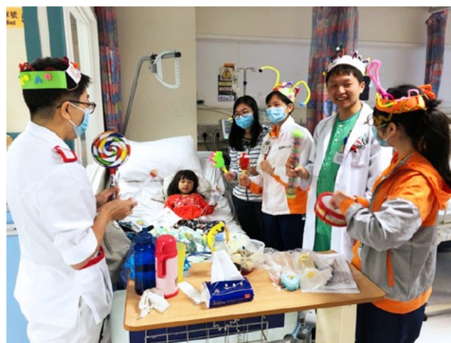
Everyone shows up to create a playful hospital ward.