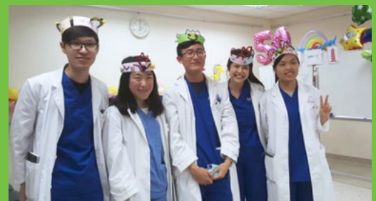
Medical students are not only good at studying - they can help boost the atmosphere at the birthday party.