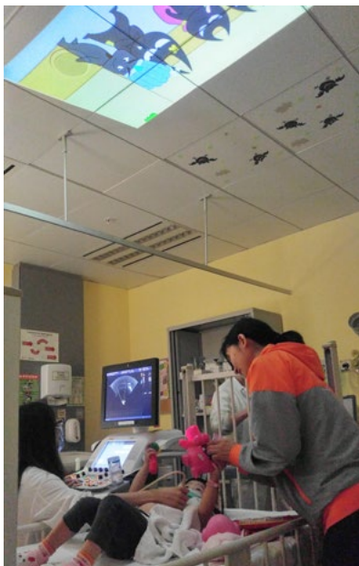
Undergoing an echocardiography while enjoying a movie.