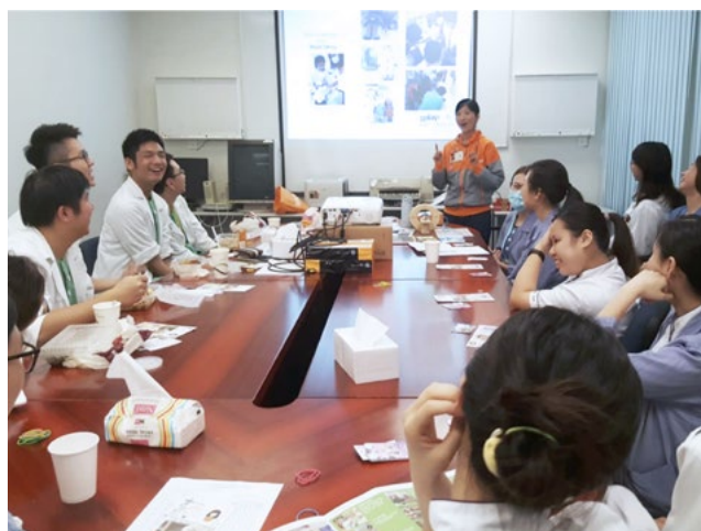
The workshop on hospital play was well attended and supported by the medical team.

Hospital play specialists live a busy life at the Paediatric and Adolescent hospital ward. Apart from briefing newly admitted children on the procedures of a hospital admission, they invite the children to participate in different kinds of play appropriate to their age, needs, preferences and health conditions. They also help children to be physically, psychologically and intellectually prepared to receive medical treatment through demonstrations of such treatments on a self-made toy bear. In addition, doctors and nurses may refer children to the hospital play specialists for early intervention when the children need help in soothing their negative emotions toward medical treatment. When children are willing to co-operate with different kinds of treatment, such as blood-taking, echocardiogram, Magnetic Resonance Imaging (MRI) or plastering, the medical team gets very excited.