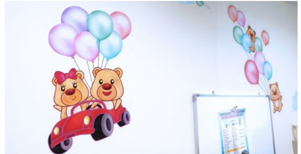
Even if bed-ridden, you can still count the balloons.